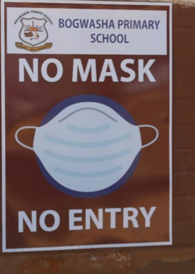
Bogwasha Primary School

The visit was to monitor compliance on the phased in of Grade 7 and 12 to schools.